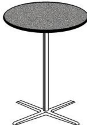
Table Dimensions 36" x 30" H 36" x 40" H At 40" high 120" linen is floor length.